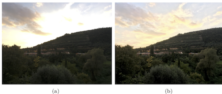
Figure 2.12. An example of capturing HDR images using a smartphone (an Apple iPhone SE): (a) An image captured with HDR disabled. (b) The same image in (a) with HDR enabled during capture; note that sky details and colors are fully acquired.

Figure 1: The correct version of Figure 2.12.